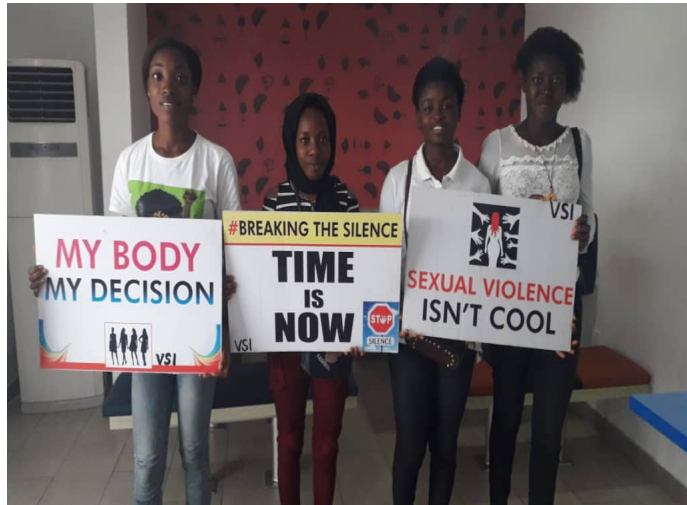
Figure 3 Representatives from AAF at the Media Dialogue.