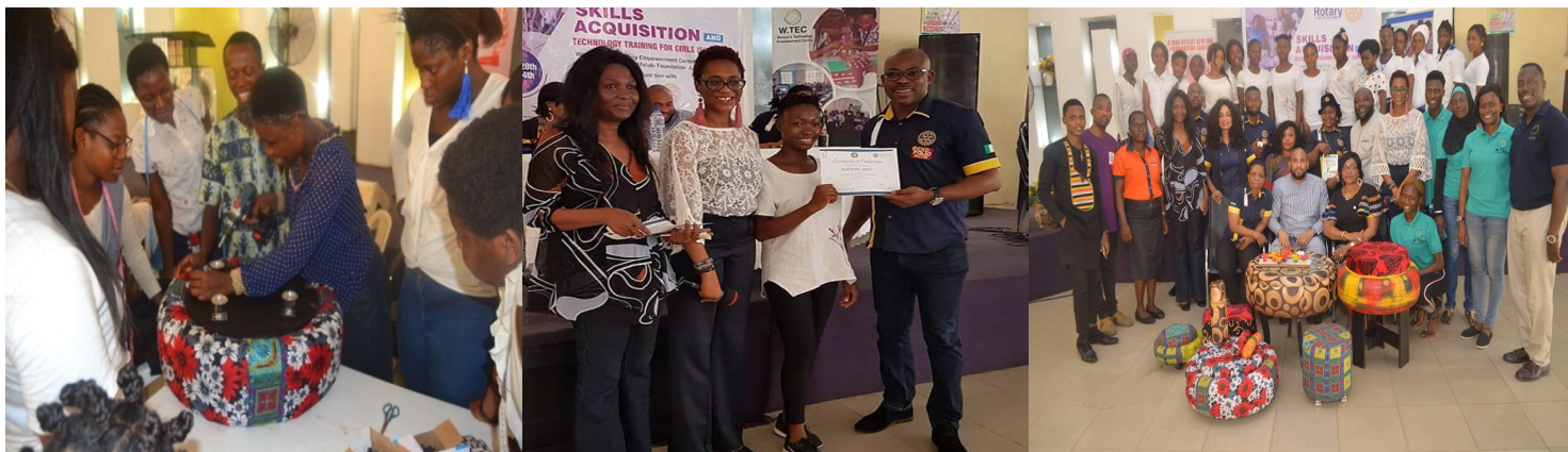
Figure 15 Skill Acquisitions and Technology Training for Girls (SATT-G)

With support from Rotary Club of Falomo, training on Recycling furniture design, bottle craft, wall planter, social media marketing and branding was organised for 20 girls. This project implemented in conjunction with W.TEC, a non-profit focused on technology contributed to access to technology for girls and knowlegd on the 3Rs of waste management; Reuse, Reduce and Recycle