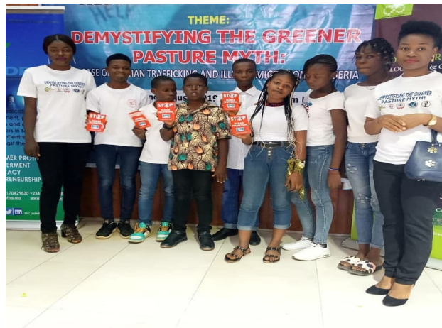
Figure 22 Some AAAF Representatives at the event

Following interactions that identified the vulnerability of widows to trafficking and increasing number of young widows as trafficked returnees, the Foundation and partners leveraged the occasion of the 2019 World trafficking day themed; DEMISTIFYING THE GREENER PASTURES MYTH to share information to students, parents, social workers and other stakeholders on irregular migration and human trafficking.