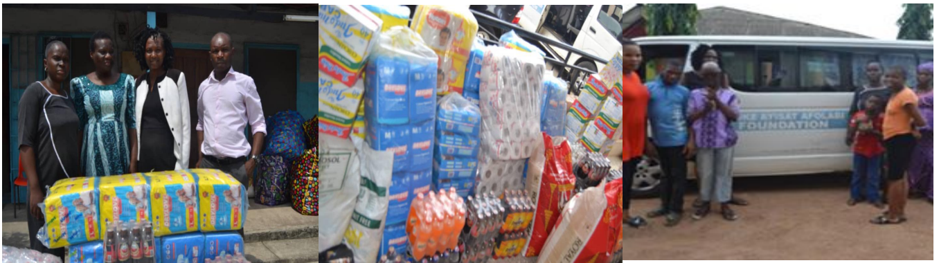
Figure 24 Visit to old People's home and Adoka home (Children with Down syndrome)