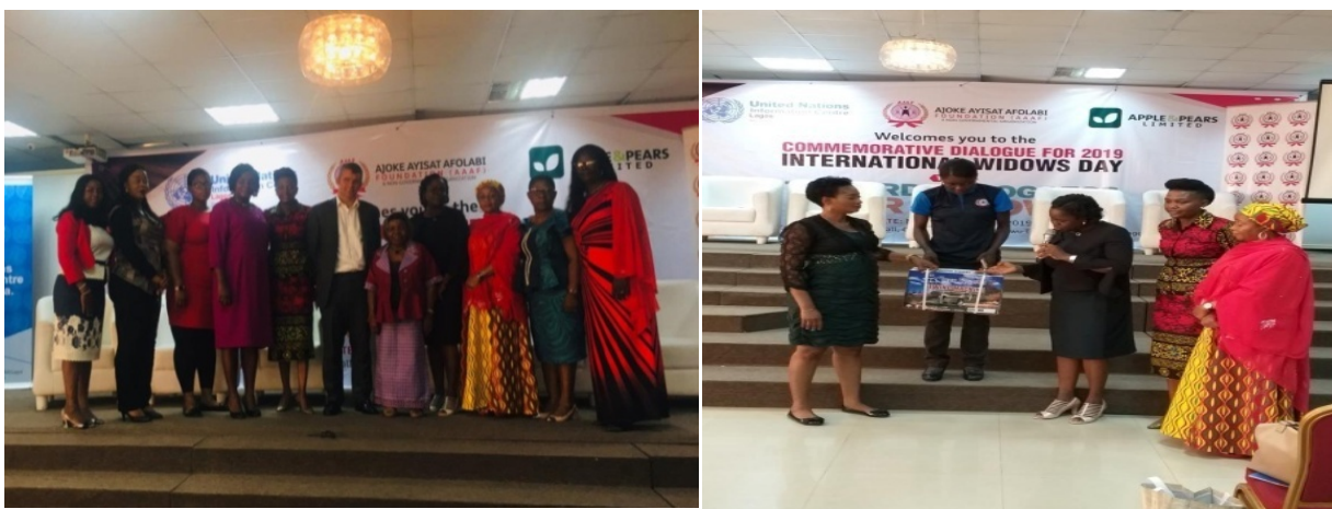
Figure 21 UN INT'L Widows Day Celebration

In collaboration with the United Nations Information Centre (UNIC), the Foundation led Nigeria's commemoration of the 2019 International Widows Day. The event was characterized by discussions and presentation of starter packs for enterprise start ups. In attendance were representatives of UNIC, the Federal Ministry of Women Affairs and the Deputy British High Commissioner