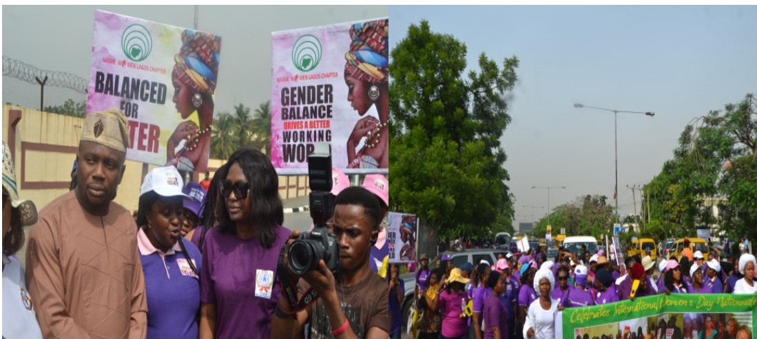
Figure 19: AAAF Executive Coordinator with other Leaders at the Lagos State House of Assembly

As part of AAAF mission in promoting wellness, collaborates with other organizations such as Nigeria Network of Entrepreneurial Women (NNEW), International Chamber of Commerce (LCCI), ANWBN, ANWORG, and ANWIP to celebrate the INTERNATIONAL WOMEN’S DAY on the 7 th of March 2019 and THEME: “BALANCE FOR BETTER” with Rally/March to Government House to commemorate the Women’s Day.