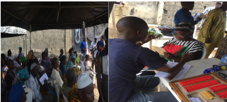
Figure 11 AAAF Quarterly Community Medical Outreach

In the first and last quarters of 2019, two Health Outreach Programmes were conducted in March and October 2019. The Foundation in collaboration with Olorunlogbon Development Community provided medical and dental services to 215 persons consisting of children, women and men at Ijegan, Ijegan/Ikotun LCDA. They were screened and treated for malaria, high blood pressure, and blood sugar. In addition to providing dental care and eye glasses, referrals were made for further care as appropriate.