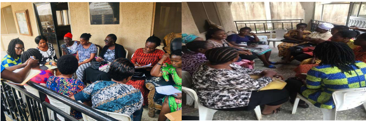
Figure 16 The Focus Group Discussion with Widows

Due to the paucity of data on widows' issues, the Foundation takes serious its responsibility to document widows' issues and a range of intervention to address the issues. At different stages, over 100 widows were engaged using a combination of quantitative and qualitative data gathering approaches. As part of documentation process, a summit was held for 50 widows as a follow up to its 2019 International Widows Day agreed conclusions. Similarly, two sessions of Focus Group Discussions were organised for a group of 10 widows apiece to document the challenges widows face as they interact with their late husband's relations. The FGDs also cover educational background, livelihoods and practical ways to thrive through widowhood. See figure 17 below