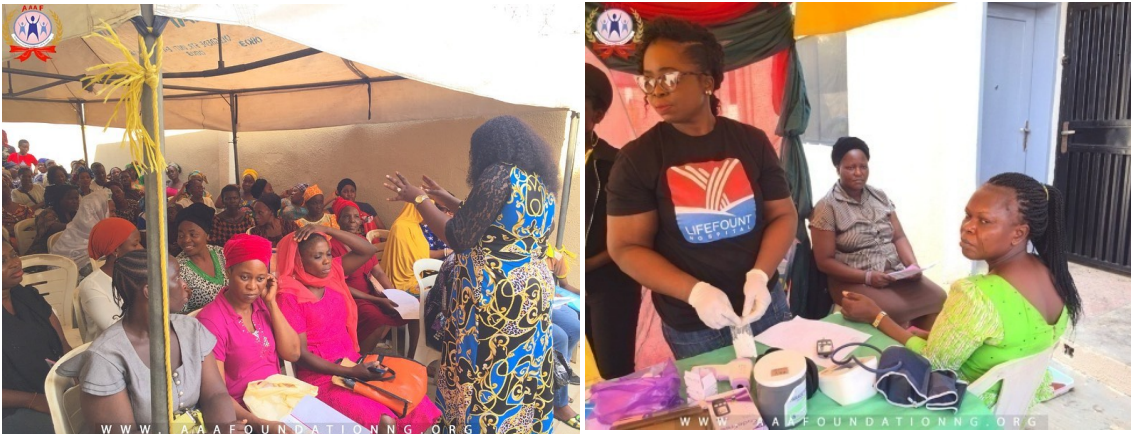
Figure 12 Breast Cancer Awareness Programme

On 17 th December, 2019, the Foundation in collaboration with Life Fount foundation organized free breast Cancer, high blood pressure and diabetics awareness and screening for 110 widows. Four widows were referred; one each for lump in breast, high blood pressure, gynaecological complications and glaucoma. This outreach was part of the Foundation’s contributions towards the empowerment of women and the achievements of SDGs 3 and 5.