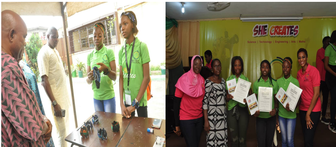
Figure 8 AAAF Scholars at SHECREATE 2019

To increase the gender diversity of the technology sector, AAAF sponsored three female secondary school scholars to participate in the 2019 sheCreate Lagos Camp . The training increased the girls' knowledge in technology as they were exposed to Programming and Robotics, Python Programming, Limens in Tech Panel, Web Design, Digital film making, Computers, Leadership and Gender studies.