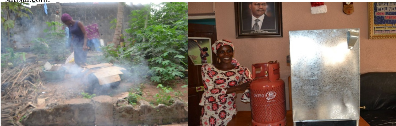
Figure 14 Empowerment targeting the reduction in the use of woodfuel

Economic empowerment for women and girls is at the fore of the Foundation's programming. As a result, the enhancement of women and girls ability to access gainful employment and own productive assets inform its multi-stakeholders processes on women empowerment and socioeconomic rights. In 2019, business grants and skills in fish processing, hair dressing and beauty parlour etc. were offered to 5 widows. See figure 18 below. Such aggressive efforts may have contributed specifically to Lagos state lowest poverty rate of 4.5% and generally, Nigeria's southwest geopolitical zone according to satista.com.