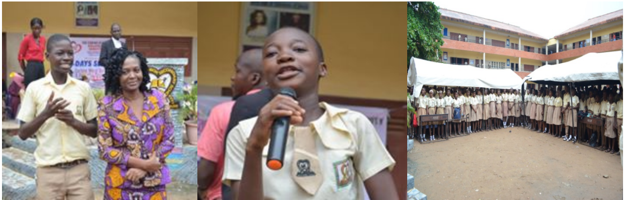
Figure 2 Presentation by the students of Millennium Senior Secondary School, Alimosho.

Following the rising rate of sexual violence against girls in public schools at Alimosho Local Government Area, AAAF partnered with Caring Heart Community Development Foundation to organise age appropriate gender awareness and sexuality education workshops in public secondary schools in the area. The workshops provided opportunities for students to engage in a range of exercises to define gender stereotypes, socio-cultural biases, sexual rights, and the difference between sex and gender. The exercise reiterates the importance of equal opportunities and inclusion as well as the need for gender responsive school policy and governance on sexual rights and services. Figure 2 below shows students as they take turn to participate