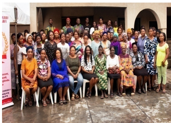
Figure1 Presentation of Tuition Fee to mothers of Scholars

AAAF recognizes the importance of education to poverty elimination and considers learning a vital process of knowledge acquisition. Accordingly, the Foundation's investment in 2019 was scaled up to cover more than classroom activities. It included practical learning options through investment in technology for vulnerable children. Overall programme strategy was to improve school enrollment for vulnerable children, particularly girls. A total of twenty-eight million, seven hundred and forty-eight thousand five hundred naira = ( #28,748, 500.00 ) was expensed on tuition payment, boot camp and vocational skills training for 300 scholars on our scholarship scheme. This payment also covers junior and senior West Africa School Certificate Examination (WASCE) fees for students at basic 9 and final senior secondary classes. See figure 1 for pictures of mothers during school fees payment