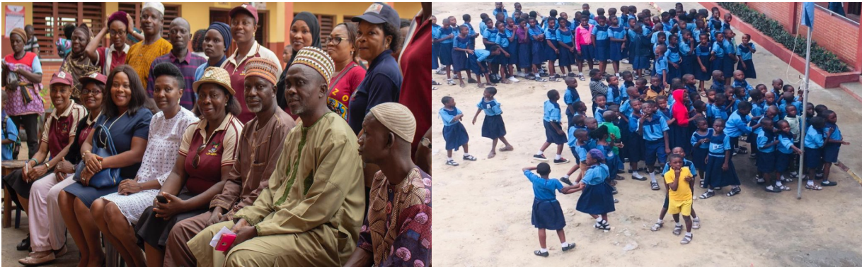
Figure 5 Cross-section of parents, teachers and students at Layeni Pry School, Ajegunle

The implementation of 2019 WBG Community Connection Campaign Project through AAAF's Support A Child with Knowledge to eliminate poverty (SACK-Poverty) project reinforced the need for improved access to quality education for children from vulnerable households. Accordingly, the project focused on promoting access to technology and clean water for pupils in public primary schools in Lagos and Ogun states. Whereas the provisions of 12-Unit computers at Layeni Primary School Ajegunle boosted opportunities for online learning for more than 3000 pupils who prior to the project took turn to undertake computer studies outside of their school premises, the water project at community primary school, Idomila, Ogun state increased access to safe water, good hygiene and sanitation. It also reduced the risks of child kidnapping by criminals in the course of searching for water in nearby villages. The implementation of the project was contributory to the achievement of Sustainable Development Goals 4, and 6 in Nigeria. See figures 4 – 5 below.