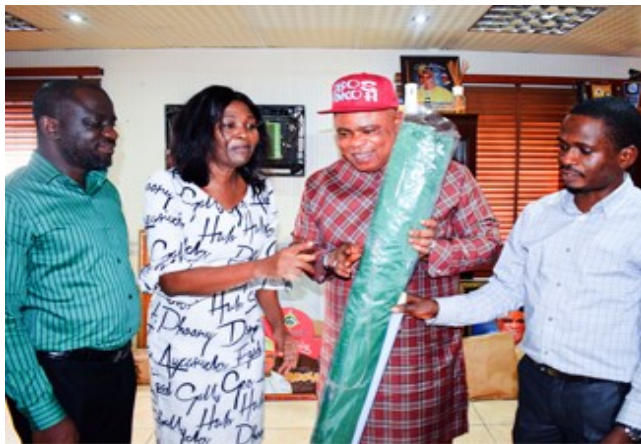
Figure 10 Presentation of Parasols to AILG

The implementation of the Expanded Immunisation Programme is critical to the successful eradication of childhood killer diseases in Nigeria. It was for this reason that the Foundation supported Ajeromi Ifelodun Local Government Area (AILGA) by donating parasols for use as workstations for Community Health Extension Workers across the 18 Wards of the Local Government Area. The essence of the project was to ensure infants and children have access to routine immunization and contribute to the achievement of SDG 3. See figure 10 for the presentation to the Executive Chairman, Honorable Ayoola Fatai Adegunle, supported by Dr. Oteniya Naheem, the Medical Officer for Health (MOH), and Mr. Ademola Ismaila, the Supervisor for Health.