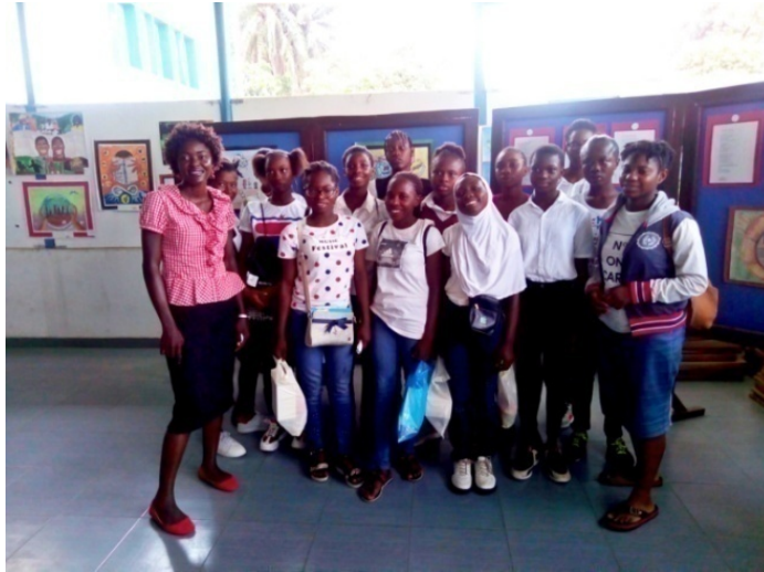
Figure 20 Girls in ICT Day Celebration.

- International Girls in ICT day celebrations, organised by the United Nations Information Centre (UNIC) and partners on Thursday, 25th April to create awareness on ICT for young girls