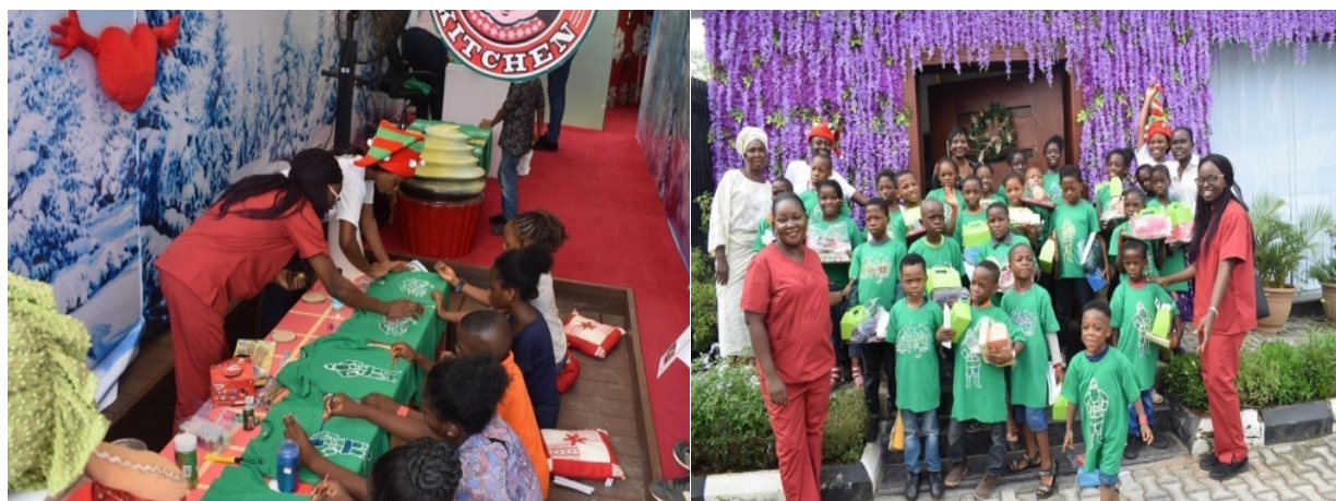
Figure 26 Learning with Fun!.