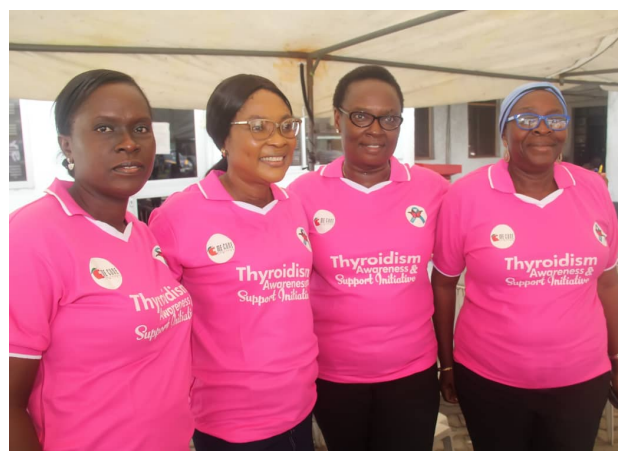
Figure 13 AAAF Field Officer at Thyroids Campaign